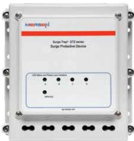
Option A: Basic